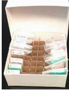
Figure B. Example packaging of FFPE blocks for shipment